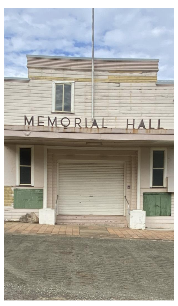
Mallanganee War Memorial Hall