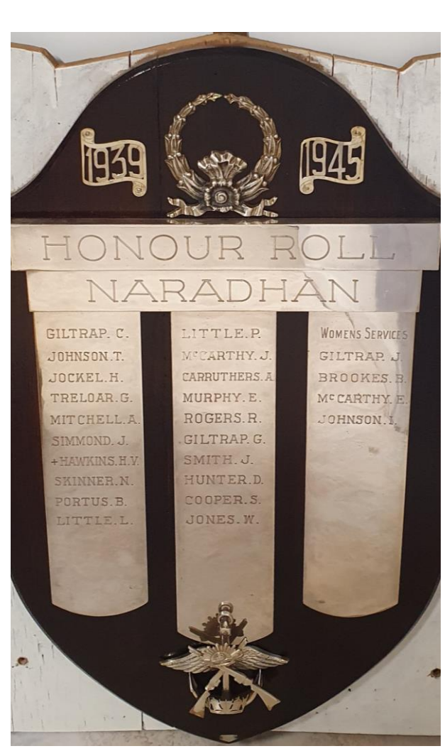
Naradhan RSL Second World War Honour Roll