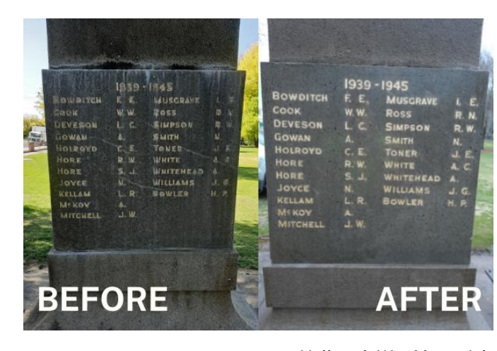
Holbrook War Memorial

Grant acquitted and conservation treatment report provided to Council