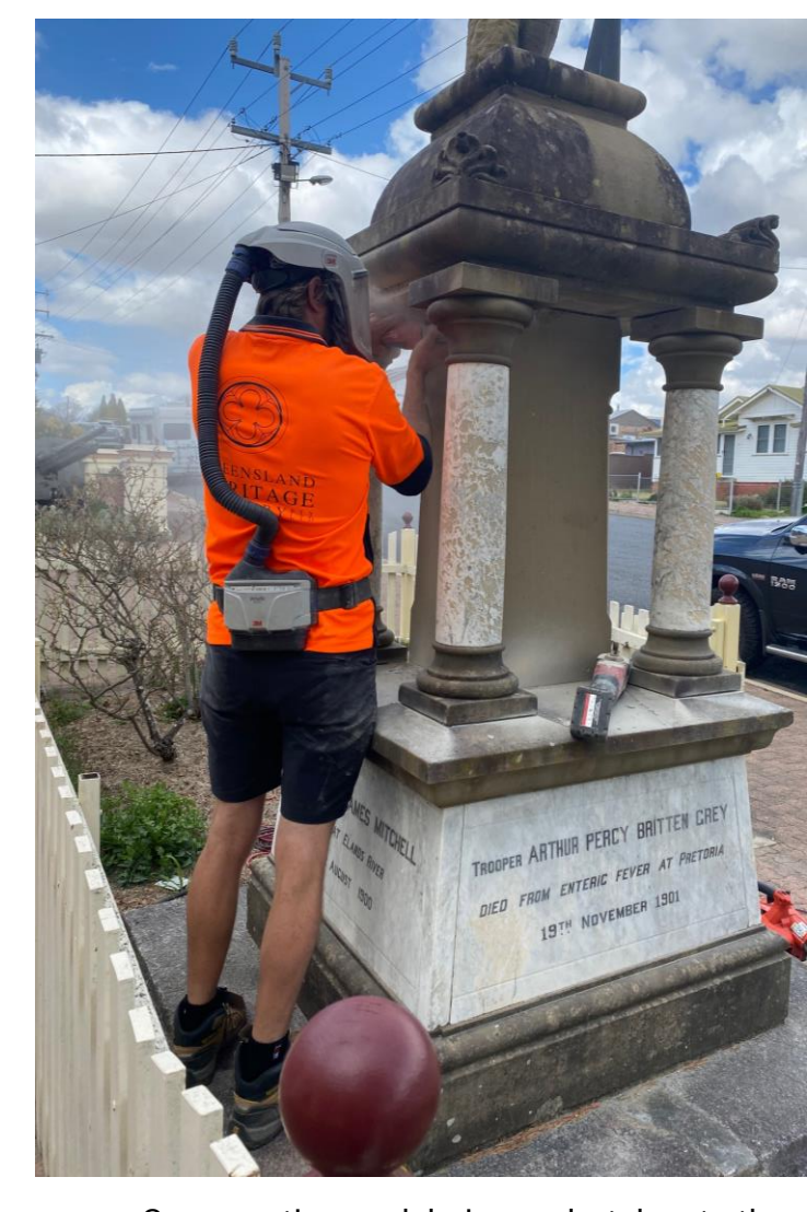
Conservation work being undertaken to the Tenterfield Boer War Memorial.