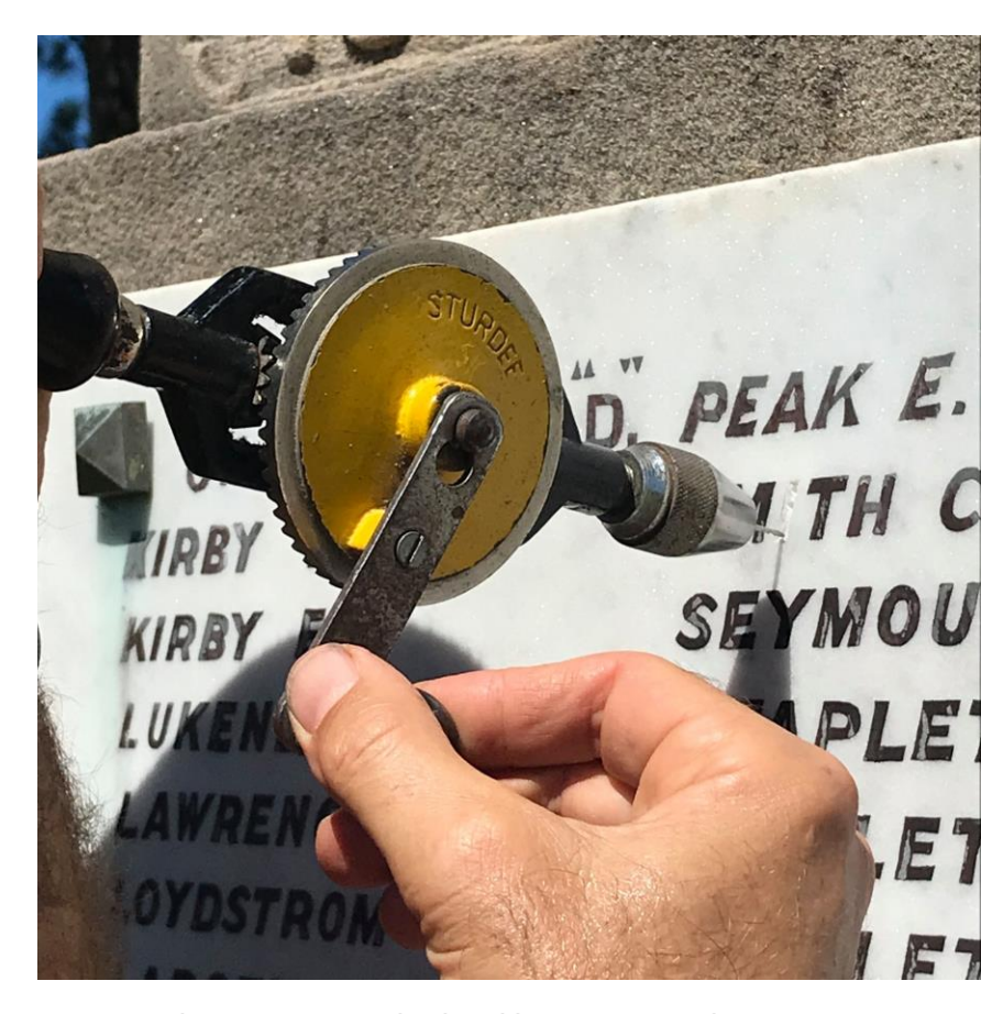
Specialist repairs to the lead lettering on the Woy Woy War