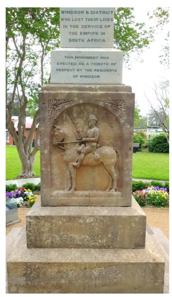
Windsor Boer War Memorial